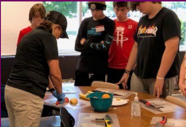
Swartz Creek Summer Camp

MSU Extension Genesee County Health and Nutrition provides nutrition education to children, youth, adults, and families with limited financial resources.