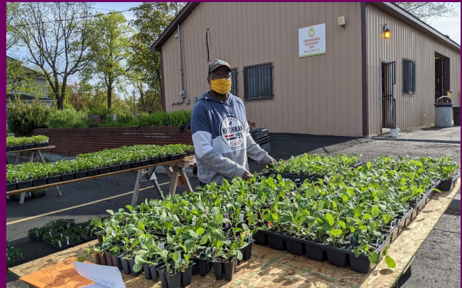
Garden Kits - Distribution Day

The Educational Farm's mission is to inspire and support healthy food production for the Flint community by sharing ideas and information in a "learn and do" environment.